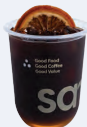
Yu Are Allstar Yuzu Americano (Hot or Cold)

为了配合我们诱人小点的创新, 我们还选择了更多新颖的水果调味咖啡和茶饮料, 为您带来更多的惊喜。