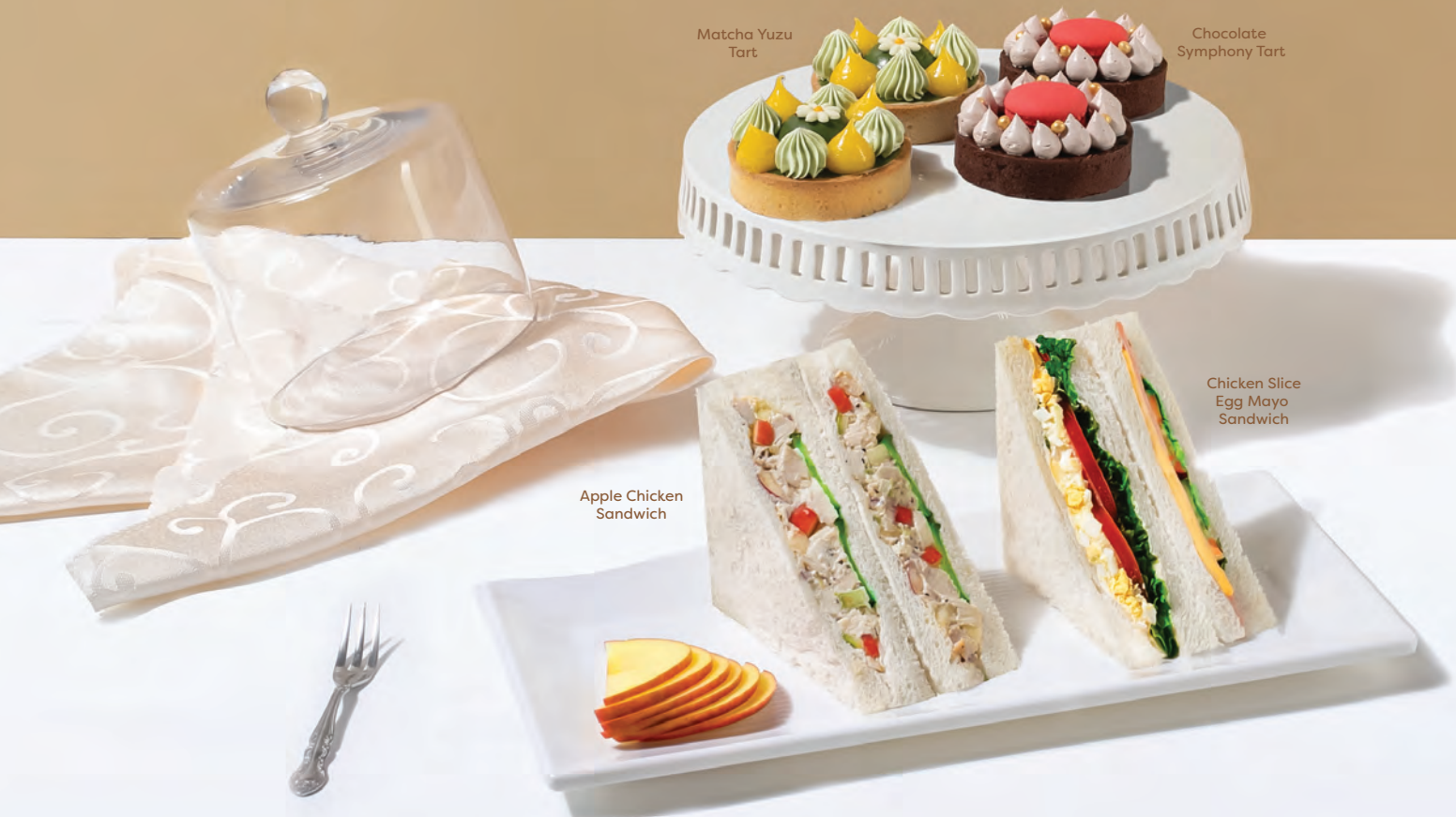
Matcha Yuzu Tart