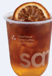
Yu Are My Sri Lankan Prince Yuzu Ceylon Tea (Hot or Cold)