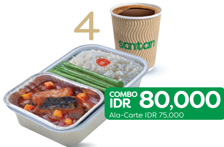
Sweet & Sour Vish