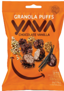
Yava Granola Puffs Chocolate Vanilla 35g Yava格兰诺拉香草味巧克力 35克 IDR 25,000