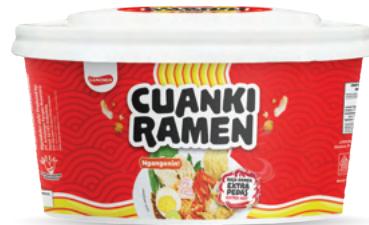
Cancimen Cuanki Ramen Extra Hot Cancimen - Cuanki特辣拉面 IDR 35,000