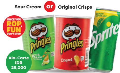
Pringles 42g + Sprite 250ml 品客 42克 + 雪碧 250毫升 IDR 45,000