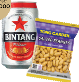
Bintang Beer 330ml + Tong Garden Salted Nut 50g 星星啤酒 330毫升 + Tong Garden盐味花生 50克 IDR 115,000