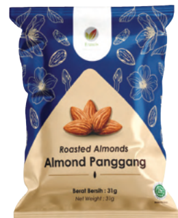
Francis Roasted Almond 31g Francis 焗杏仁 31克 IDR 35,000