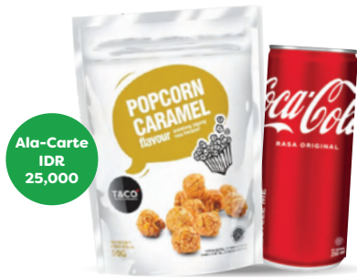
Popcorn Caramel Flavour 50g + Coca Cola Original 250ml 焦糖味爆米花 50克 + 可口可乐原味 250毫升 IDR 45,000