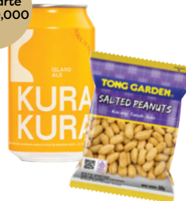
Kura Kura Island Beer 330ml 库拉库拉岛艾尔啤酒 330ml IDR 115,000