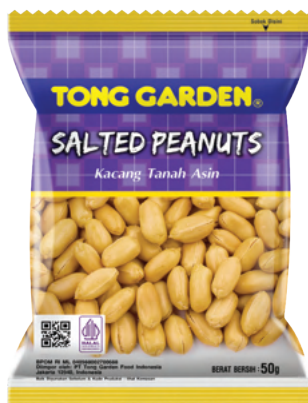
Tong Garden Salted Peanuts 50g