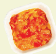
Pineapple Chili Sauce