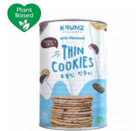
Krunz Cookies & Cream Thin Cookies 80g Krunz 曲奇&奶油薄饼干 100克 IDR 50,000