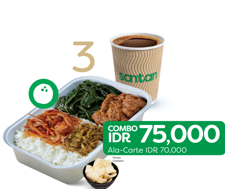
Nasi Padang Uda Ratman 巴东饭