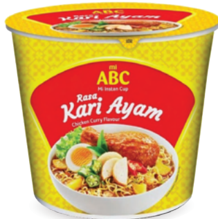
Mi ABC Chicken Curry Mi ABC咖喱鸡汤面- 关东煮 IDR 30,000