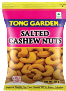
Tong Garden Salted Cashew Nuts 40g Tong Garden盐味腰果 40克 IDR 35,000