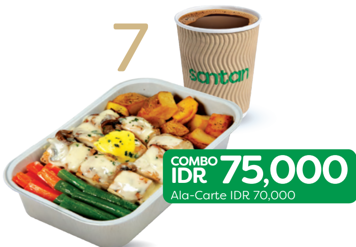
Roast Chicken Dijon with Creamy Mushroom Sauce