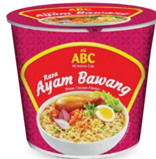
Mi ABC Onion Chicken Mi ABC洋葱鸡肉汤面 IDR 30,000