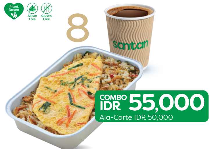
Nasi Goreng Teri Daun Jeruk