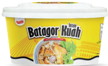
Cancimen Batagor Kuah Cancimen - 关东煮 IDR 35,000