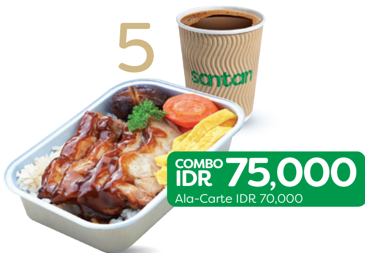
Chicken Teriyaki with Rice