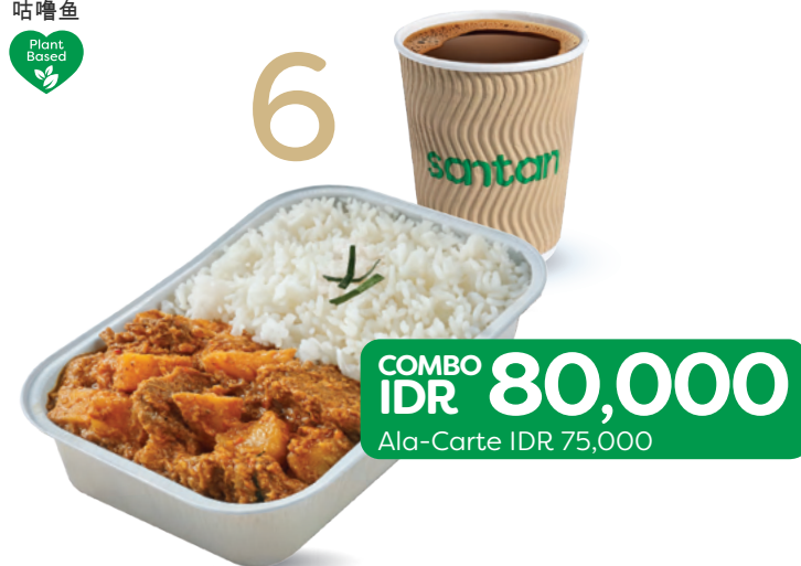
Rendang with Coconut Rice