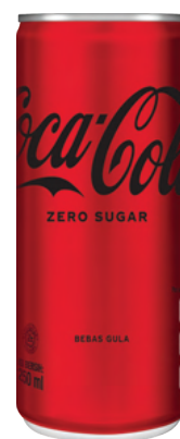
Coca Cola Zero 250ml