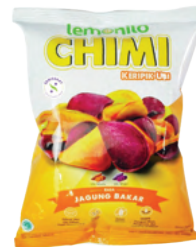
Lemonilo Chimi Sweet Potato Roasted Corn 40g Lemonilo Chimi 烤玉米风味红薯片 40克 IDR 25,000