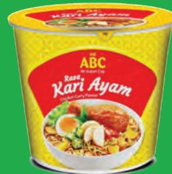
Mie ABC Chicken Curry Mie ABC咖喱鸡汤面 IDR 30,000