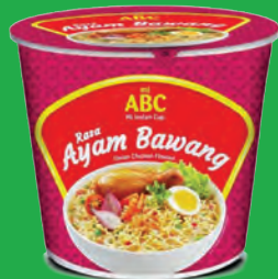
Mie ABC Onion Chicken Mie ABC洋葱鸡肉汤面 IDR 30,000