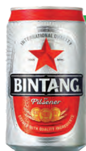
BINTANG BEER 星星啤酒 IDR 100,000

Terms and Conditions: Purchases of Alcohol