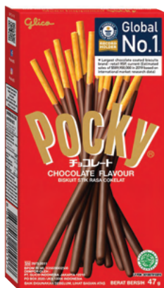
Pocky Chocolate Flavour 47g