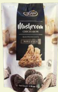
Ja Lees Truffle Mushroom Chicharon 50g 香脆蘑菇脆片 チチャロン トリュフ風味 PHP 130