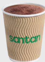
Hot Chocolate 热巧克力 (速溶) 35克 ホットチョコレート (インスタント) 35G PHP 90

Only available for onboard purchases on Philippines AirAsia (Z2) flights while supplies last. Prices are subject to daily currency exchange rates. The pictures shown on this menu are for illustration purposes. Terms and conditions apply