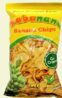
Villa Socorro Banana Chips 香蕉片 バナナチップス PHP 130