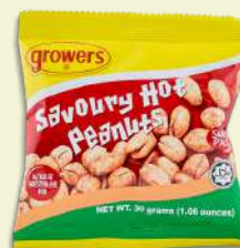
Growers Savory Hot 30g 辣味花生 スパイシー PHP 40