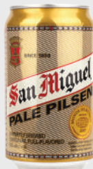
San Miguel Pale Pilsen 生力皮尔森啤酒 サンミゲル パールピルセン PHP 160