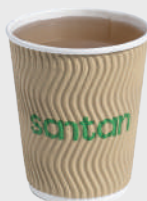
Hot Tea 川宁绿茶 緑茶 PHP 90