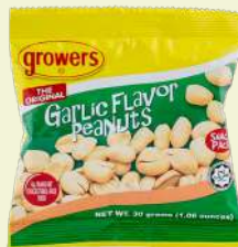
Growers Garlic Flavor 30g 蒜味花生 ガーリック PHP 40