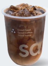
CAFFE MOCHA 混合摩卡咖啡 ブレンド カフェモカ PHP 160 - HOT PHP 170 - COLD