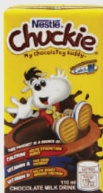
Chuckie 饮料 チャッキー チョコレートドリンク PHP 80