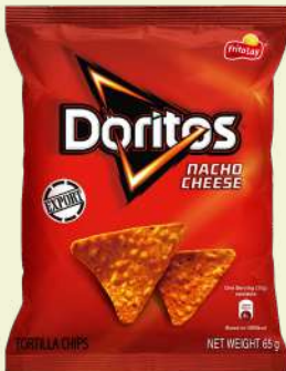
Doritos Nacho Cheese 65g 多力多滋玉米片 ドリトス PHP 120