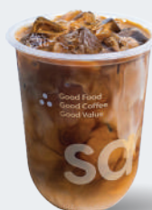
CAFFE LATTE 混合拿铁咖啡 ブレンド カフェラテ PHP 150 - HOT PHP 160 - COLD

With each sip, you'll surely tell him or her, "I love you a latte!"