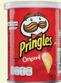
Pringles Original 品客薯片 プリングルズ PHP 100