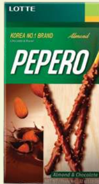
Lotte Pepero Almond Flavor 派派乐饼干 ベペロ PHP 120