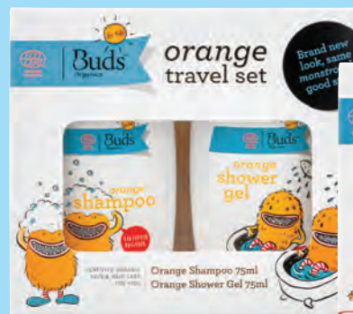
Orange Travel Set for extra tangy freshness.