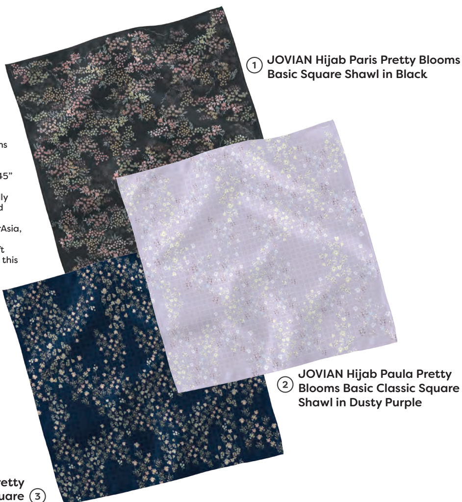
① JOVIAN Hijab Paris Pretty Blooms Basic Square Shawl in Black