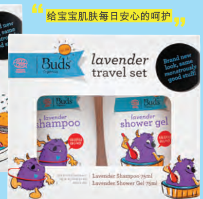
Lavender Travel Set for a lovely soothing sense of calmness.