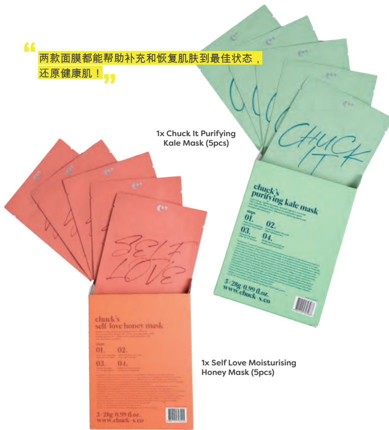
1x Chuck It Purifying Kale Mask (5pcs)