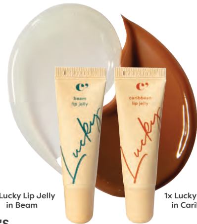
1x Lucky Lip Jelly in Beam