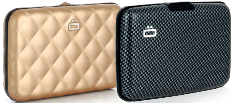
ÖGON Quilted Button Rose Gold

法国欧夹玫瑰金菱格纹保安铝制钱夹 Dimensions (H x W x D): 10.8 x 7.2 x 2 cm Weight: 78g