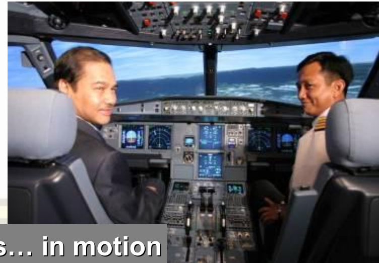
A320 Simulators... in motion