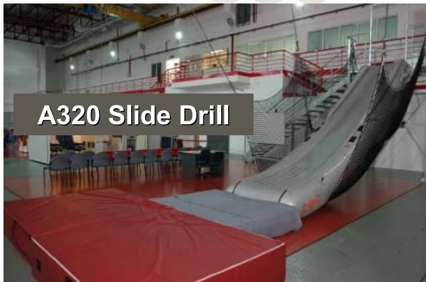
A320 Slide Drill