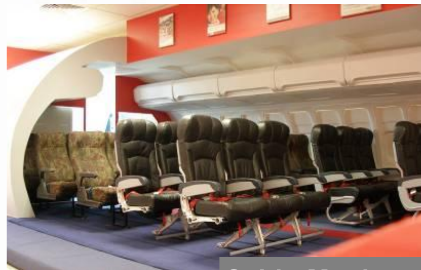
Cabin Mock up