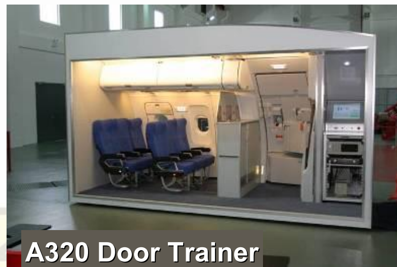
A320 Door Trainer